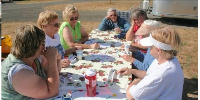
Mexican Train in the sun