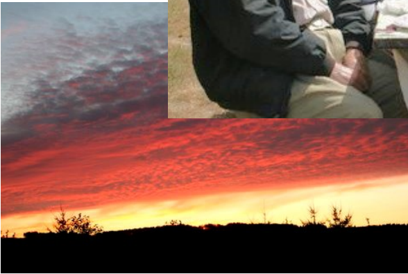
Sat. evening sunset!