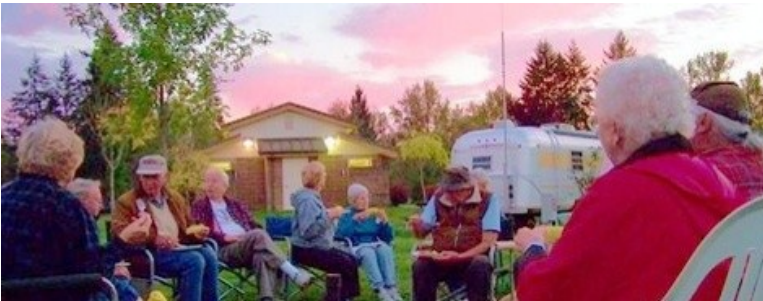
Around the fire