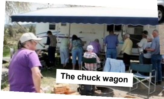
The chuck wagon