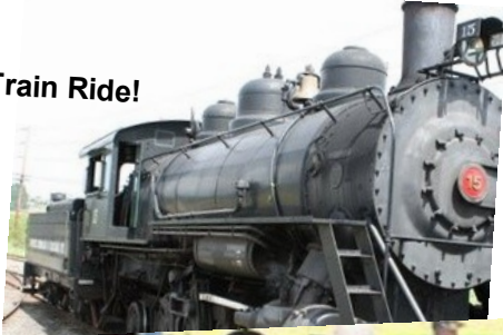
Steam Train Ride!