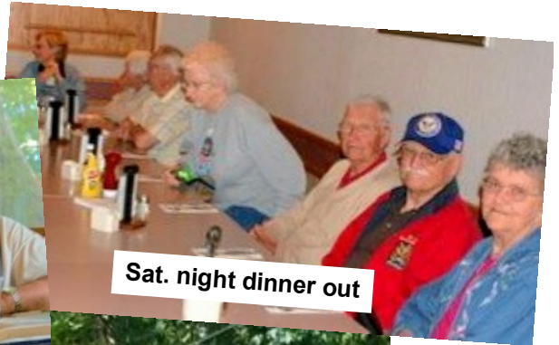
Sat. night dinner out