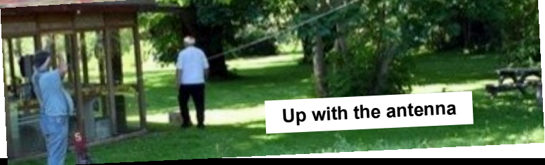
Up with the antenna