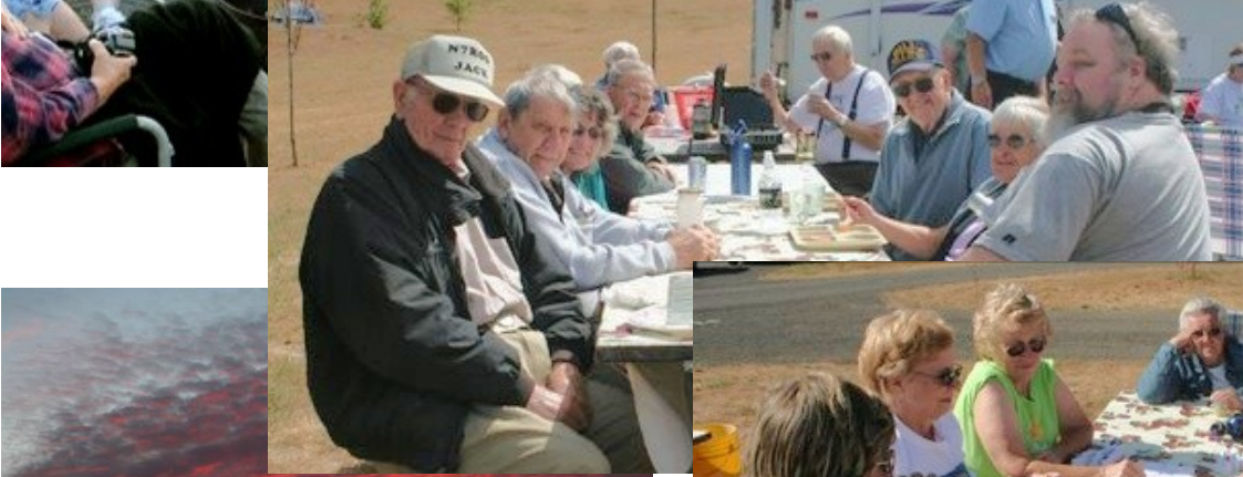
Food and friendship